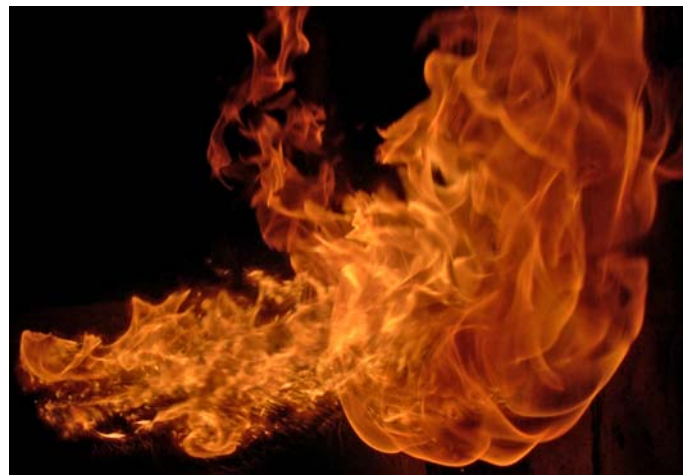
Figure 1. Jet Diffusion Flame, Re = 8323.

The purpose of this image is to photograph the complex phenomena of a turbulent jet flame. An aerosol can of WD-40 was used as the fuel for the jet diffusion flame. The source of oxidizer for this combustion process is just the oxygen contained in the ambient air. The flame is impinging on a wall as seen below in Figure 1. The fuel jet was shot through a match to ignite the fuel and begin combustion. The only source of light for this image is the small amount of moonlight coming in through the open garage door. The very dark garage enhances the image because of the drastic contrast. For safety reasons, the flame is impinging on a cool cement wall in the garage. Furthermore, the image was taken at night so the garage door could be open to allow for proper ventilation.