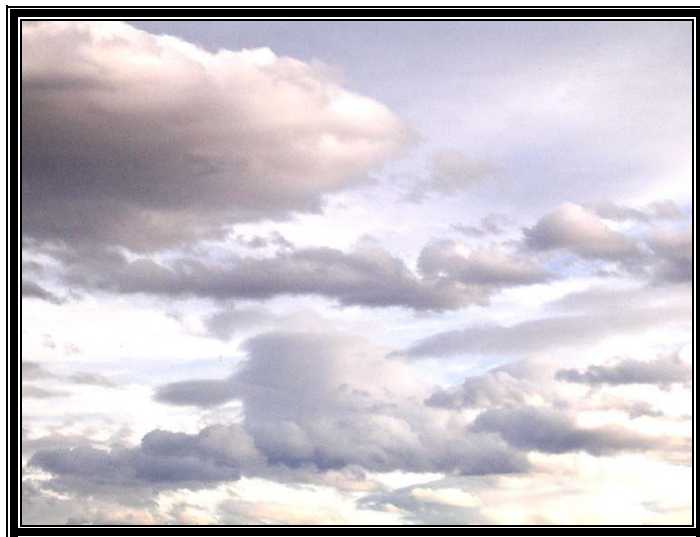
Figure 4: Edited Image