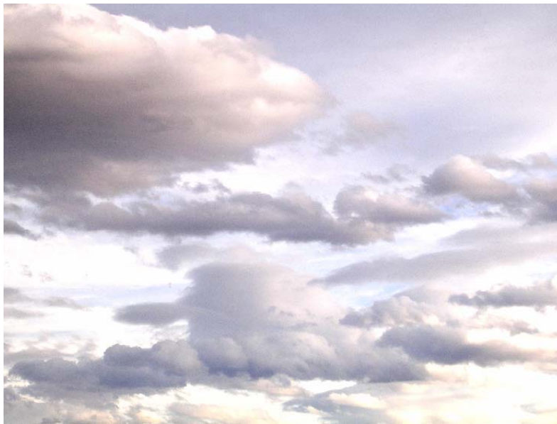
Figure 1: Clouds 1 final picture

After photographing an immense amount of clouds, I finally decided on a specific cloud. The purpose of the image was to capture a beautiful picture of a cloud(s), and then describe and understand the physics behind that cloud(s). I tried using both digital and film to take photos, and used a red filter with black and white film. Unfortunately, I did not have the printing available for this project, and those photos will have to come later. The final image after a slight photo editing can be seen below.