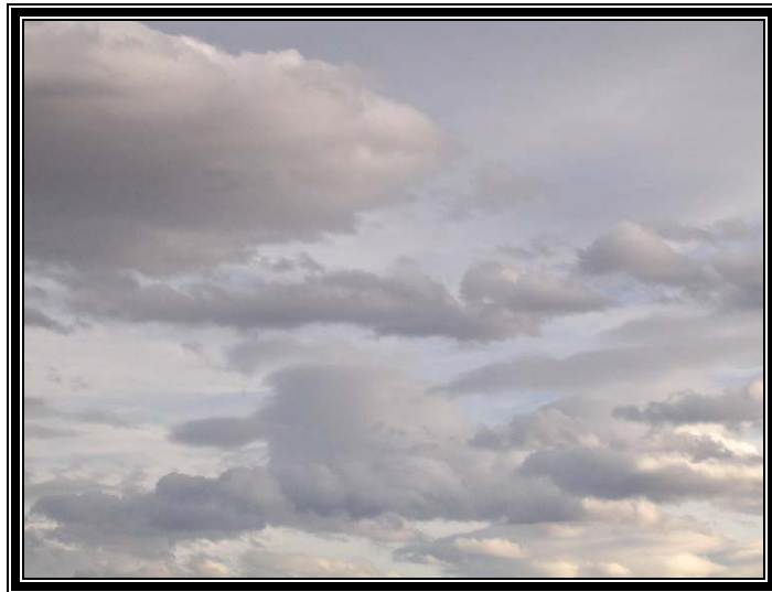
Figure 3: Original Image