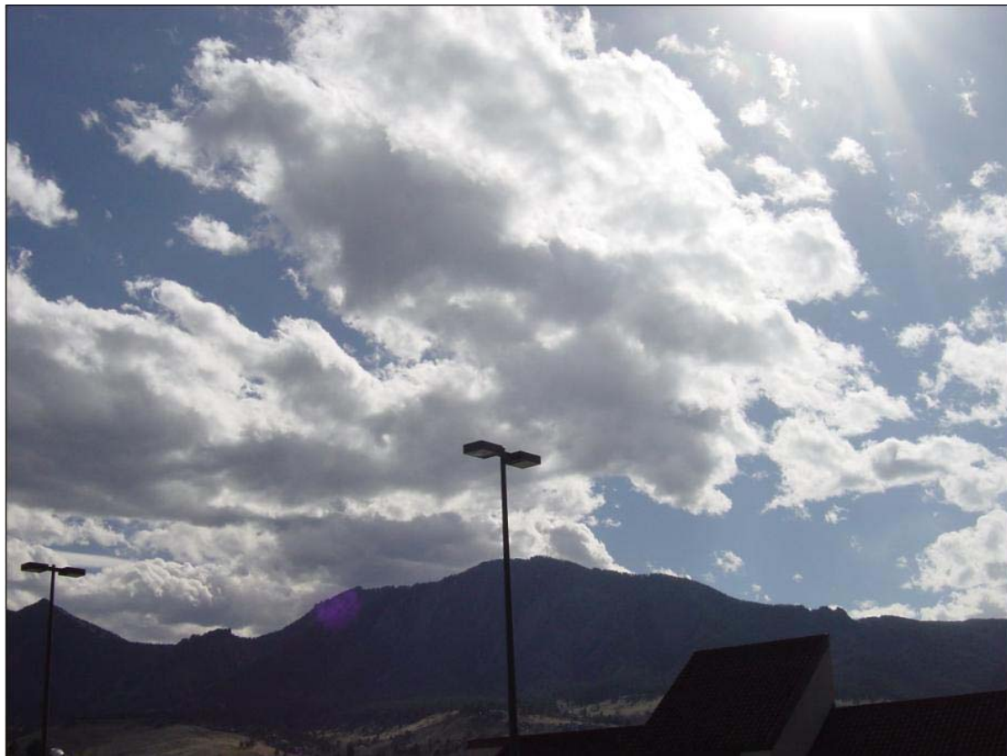
Figure 1: Original image of clouds

The picture shown in figure 1 is the original image of clouds which was taken on Wednesday, the 12 th of April, at around 3:30 in the afternoon. The location of the image that has been taken was at the top floor of the parking structure of lot 436 near by the engineering center on the University of Colorado at Boulder. The image was