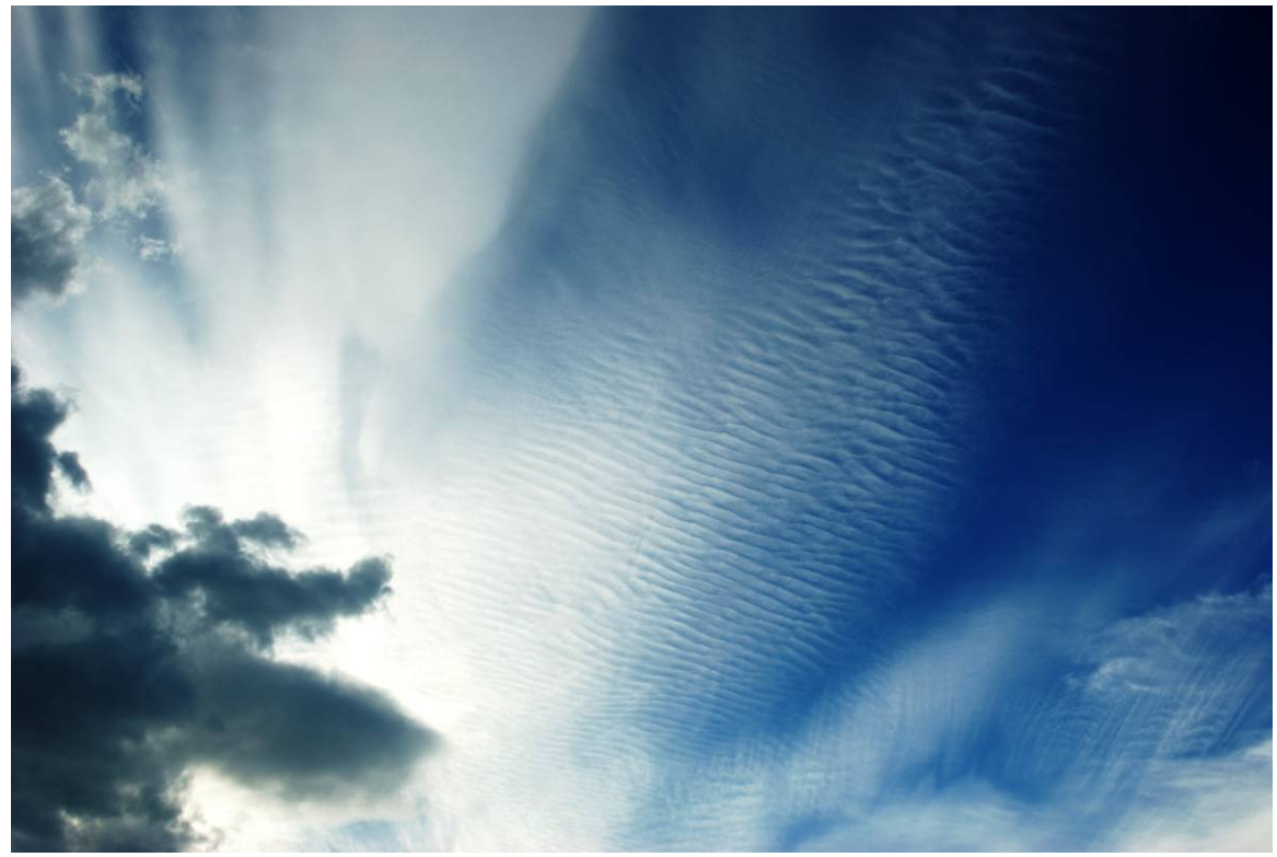
Figure 3: Cirrocumulus Undulatus, Cumulus, Cirrus Fibratus