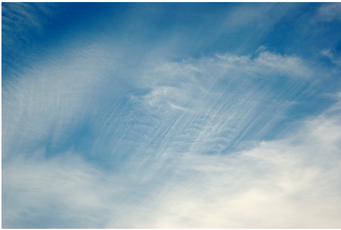
Figure 4: Cirrus Fibratus