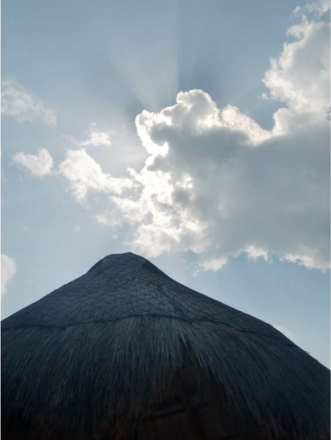
Figure 4 - Original Cloud Photograph.