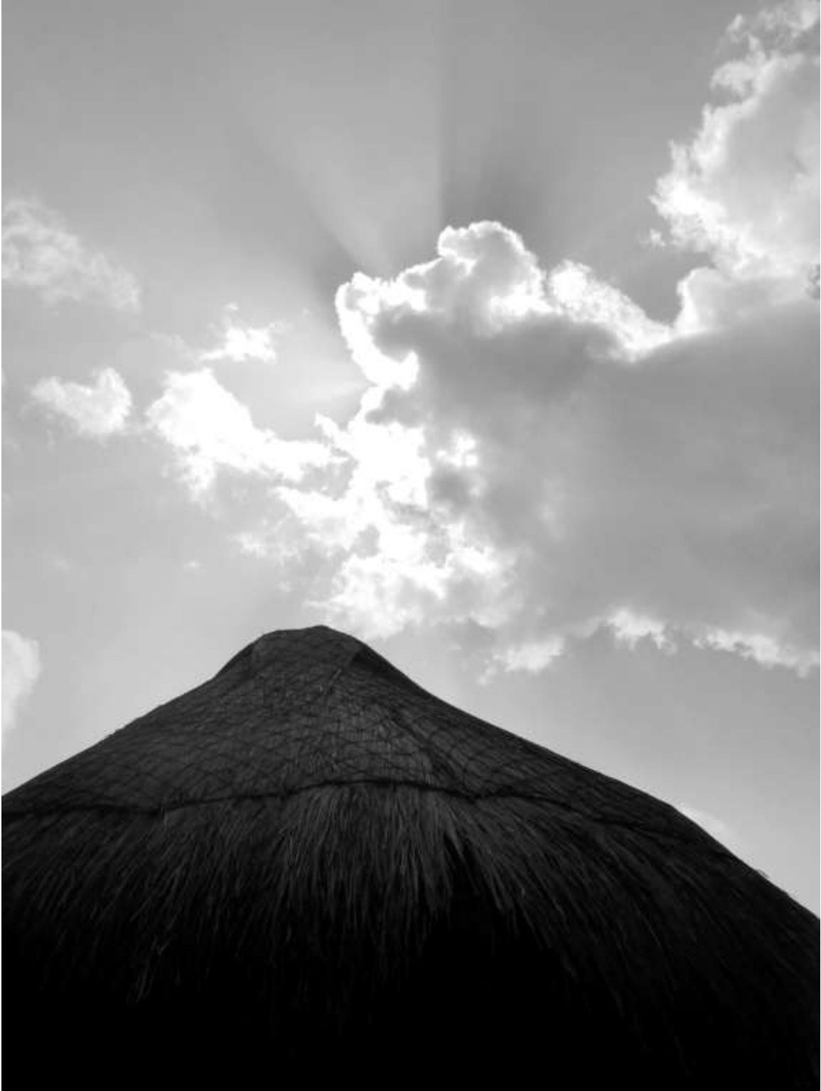
Figure 3 - Edited Cloud Photograph.