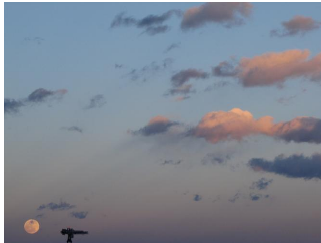
Figure 3: Unedited image of left side of panorama

Because I have no experience taking pictures of clouds, my approach to this image was using the automatic exposure settings on the camera and hoping the image would turn out. One of the original images in the panorama taken is shown in Figure 3. The original image is very washed out and the colors are not very nice. I believe if I knew more about the proper techniques for taking such a picture, the original image would have turned out much nicer, requiring much less editing. As it was, I took this image and increased the contrast and changed brightness's between successive images in the panorama to match each other. I also decided to clone-out the crane because it distracts from the clouds and doesn't add anything to my intentions. More specification can be found below.