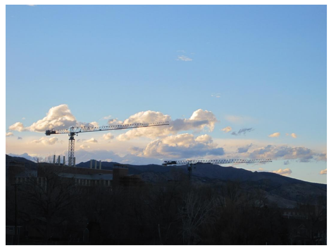
Figure 2: Original Image

The image that resulted from this process is one that captures both the beauty and science of that this cloud formation. The crane, though not related to the clouds, provides a strong diagonal and very rigid line structure to contrast the puffy gradual curves of the clouds. The viewer's eye is drawn up the arm of the crane and seems to be elongated by the nearly parallel puff of clouds behind it. The weight of the prominent clouds on the right is counterbalanced by the large cloud on the left. Some have commented that this image reminds them of the 50's labor union promotion murals that were created displaying industrial equipment and picturesque backgrounds. The physics of the clouds are well revealed and the image is aesthetically pleasing. If done again it would be nice to get to a position where both cranes in the original image had matching clouds in the background.