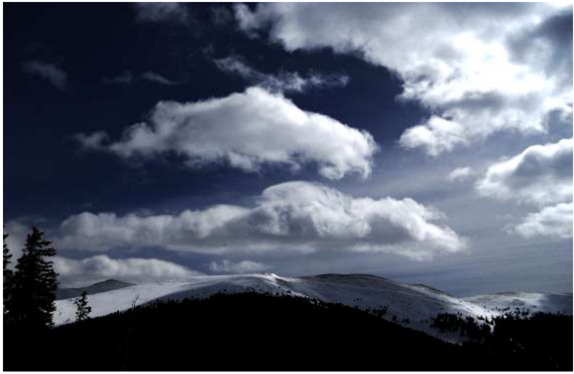
Figure 1: Clouds II Assignment photo

The picture I captured is shown below in Figure 1 and was taken on March 24, 2011, at approximately noon mountain standard time. The photograph was taken from Keystone Ski Resort's North Peak facing east. The mountain below the cloud is Independence Peak, thus the angle could be approximated at 15 degrees above the horizon.