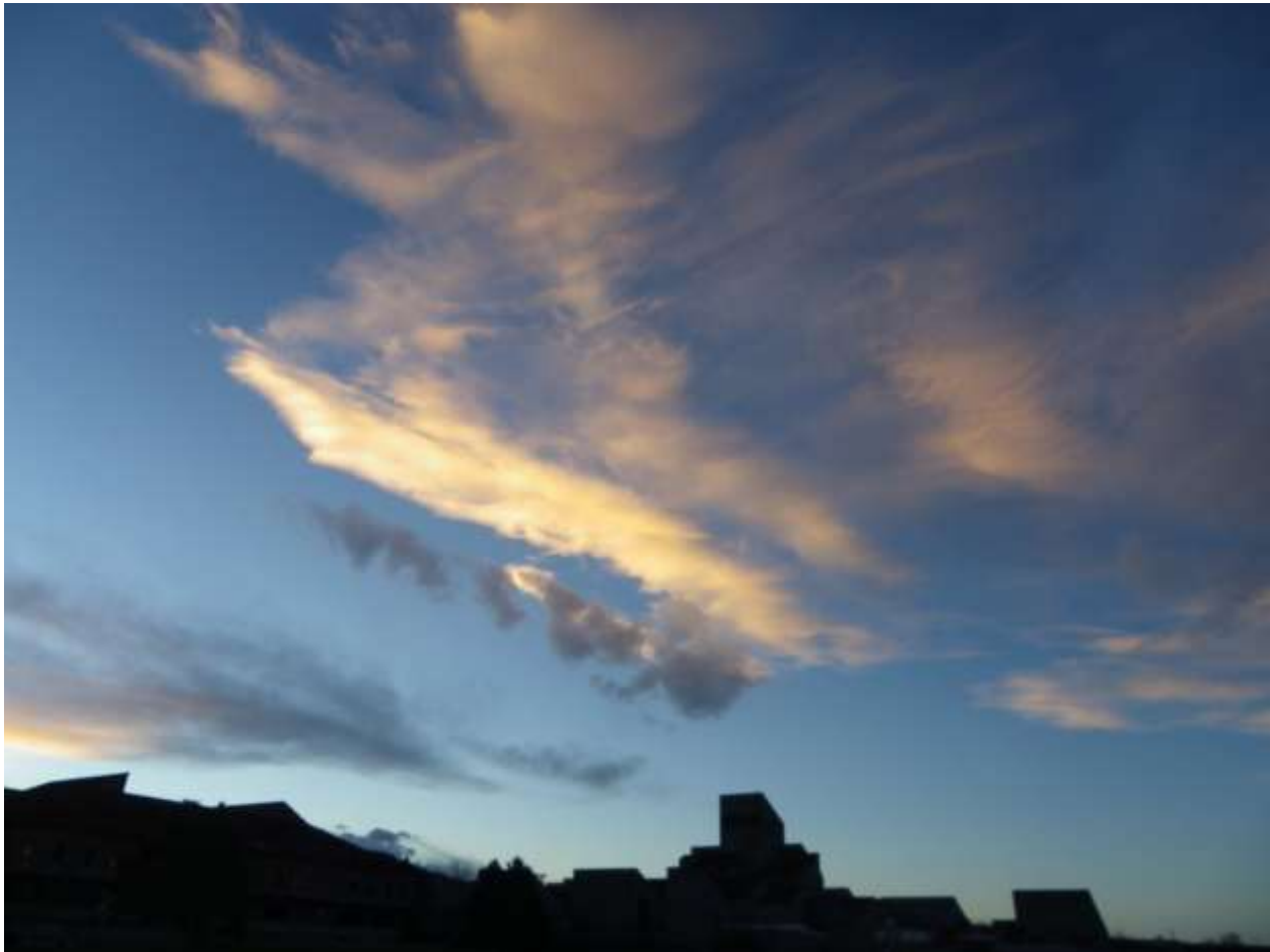
Figure 3 - Clouds 2 Original Image

mentioned before, the estimated altitude for the altocumulus lenticularis was about 4000 meters. The skew-t plot shows a minimum difference between the air temperature and the dew point temperature to occur at an altitude of about 6700 meters. This altitude value seems more indicative of most of the other clouds in the sky that day, and I believe the altocumulus lenticularis pictured in the image to be relatively low in the sky compared to the other clouds.