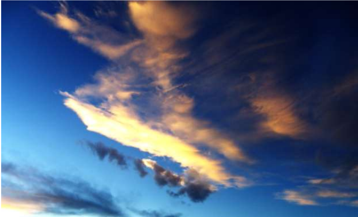
Figure 1 - Clouds 2 Final Image

The image used for the second “Clouds” assignment was captured on April 2 nd , at 6:32 PM. The location of the image was on Regent Drive, near the southeast corner of the business field, looking northeast over the Engineering Center. This image was chosen because of the fact that it was at sunset, and is very aesthetically pleasing. Additionally, the bright yellow mountain wave cloud seems to be peeled away by air currents, and the clouds to the right of it have interesting shape and composition. The image was directed at about a 30 degree angle from the horizon in the center. Using a horizontal distance estimate of about 5 miles, the height estimate of the bright cloud in the image is about 4000 meters. Verification of this estimate can be found later in the analysis of the skew-t plot.