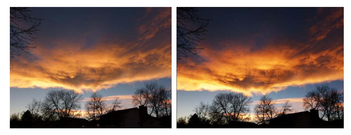
Figure 4. Cloud image before (left) and after (right) post processing.

Adobe Photoshop CS5 was used for post processing of the cloud image. The original 4320 x 3240 pixel JPEG image was imported into Photoshop to begin post processing. The image was then cropped to 4320 x 3132 pixels in order to remove the lights from the houses near the bottom center of the photo. The contrast was then adjusted from zero to 60 in order to deepen the rich colors from the sunset illumination. The original image and post processed image are shown left to right in the figure below.