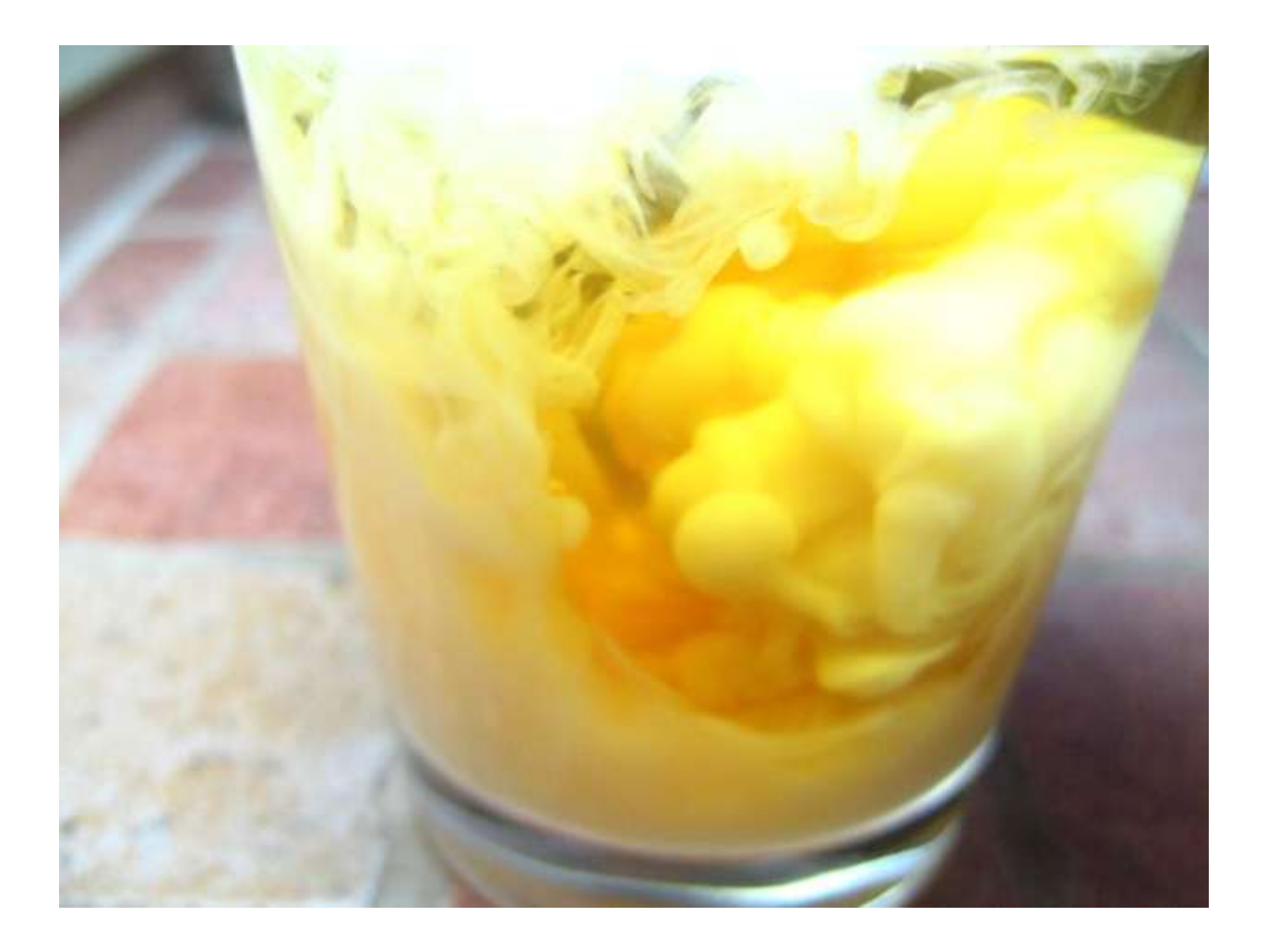
Figure 2: Original, unedited image taken on 27 Mar 2011.