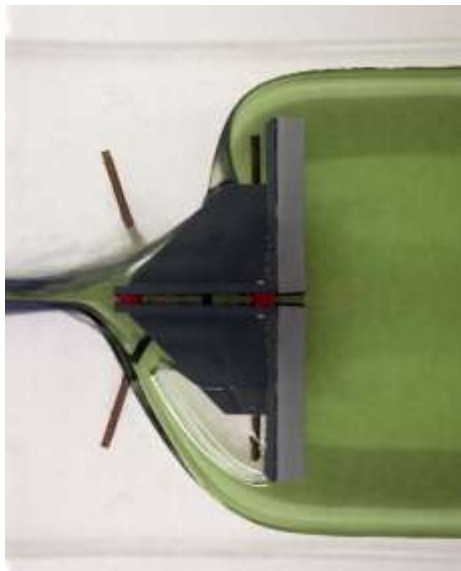
Figure 2- The Final image. It shows the ventilated nappe on the bottom portion, and the unventilated nappe on the top.

The flow over a weir can be characterized in two different ways, ventilated and unventilated nappe. As previously mentioned, the nappe is the sheet of water flowing over the weir. If the