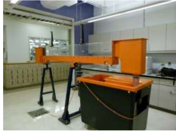
Figure 1- The flume used to conduct the trials to produce the images. Fluid flows from left to right in this image.

nappe is unventilated, then the sheet of water will remain attached to the back of the weir. Looking at the edited image, shown in Figure 2, the top portion of the image shows an unventilated weir. When the weir is ventilated, the nappe is detached from the weir, and a pocket of air separates the nappe from the weir. This can be seen in the bottom section of Figure 2.