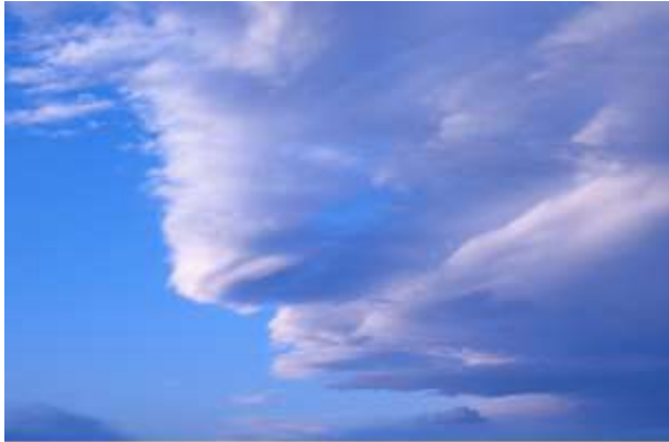
Raw "Before" Image