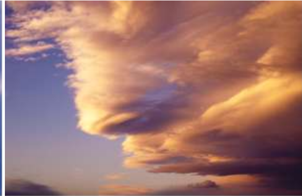
Post-Photoshop "Final" Image

This image was taken to fulfill the requirements of the Clouds #1 assignment in the Flow Visualization class offered at the University of Colorado in Boulder. I attempted to capture the beauty of a cloud formation illuminated by the color spectrum of the sunset. After capturing the image I wanted to alter the colors and edit the photo so as to enhance the features of the atmospheric phenomenon and contrast the cloud from the background.