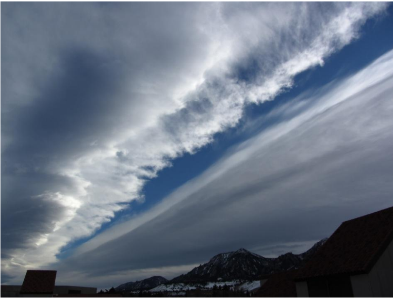
Figure 3: Original image before editing

the focal length of the lens being 5mm (35mm equivalent focal length = 28.5mm). The original image before being edited in Gimp can be seen in figure 3 below.