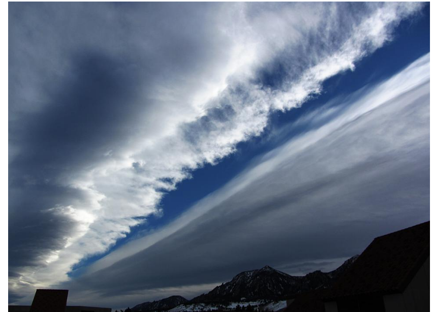
Figure 4: Final edited image

After the original image was captured it was imported to Gimp and converted from JPG to a TIF file so that the image would maintain its format. The original image was then cropped in Gimp to reduce the size of some of the objects in the foreground. Additionally, the curves tool was used to brighten the blue sky and white wisps of the cloud as well as darken the grays found in the cloud and landscape. The image was then enhanced with the unsharp mask tool to create a sharper overall image. The final edited image can be seen in figure 4 below.