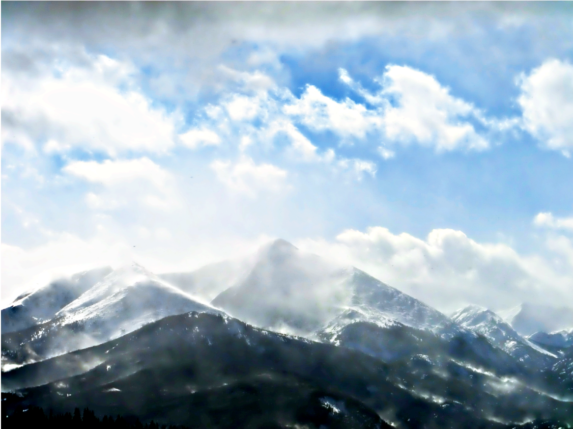
Holy Cross Jan. 22nd 2012 2:00 PM MST

This photograph of Mt. Holy Cross was taken at the top of chair two in Vail, CO. It was a very snowy morning with little to no sun at all for most of the day. Just before leaving for the night the sky opened up for just a moment over Holy Cross, allowing this image to be taken. The reason I liked this photo so much was because of the blowing snow that can be seen. It not only shows us what the wind conditions were like that afternoon, but also that it had just snowed a whole lot. The blowing snow, as well as falling snow on the left side, blurs the image. I liked the way this made the image look, more like it was a painting rather than a photo.