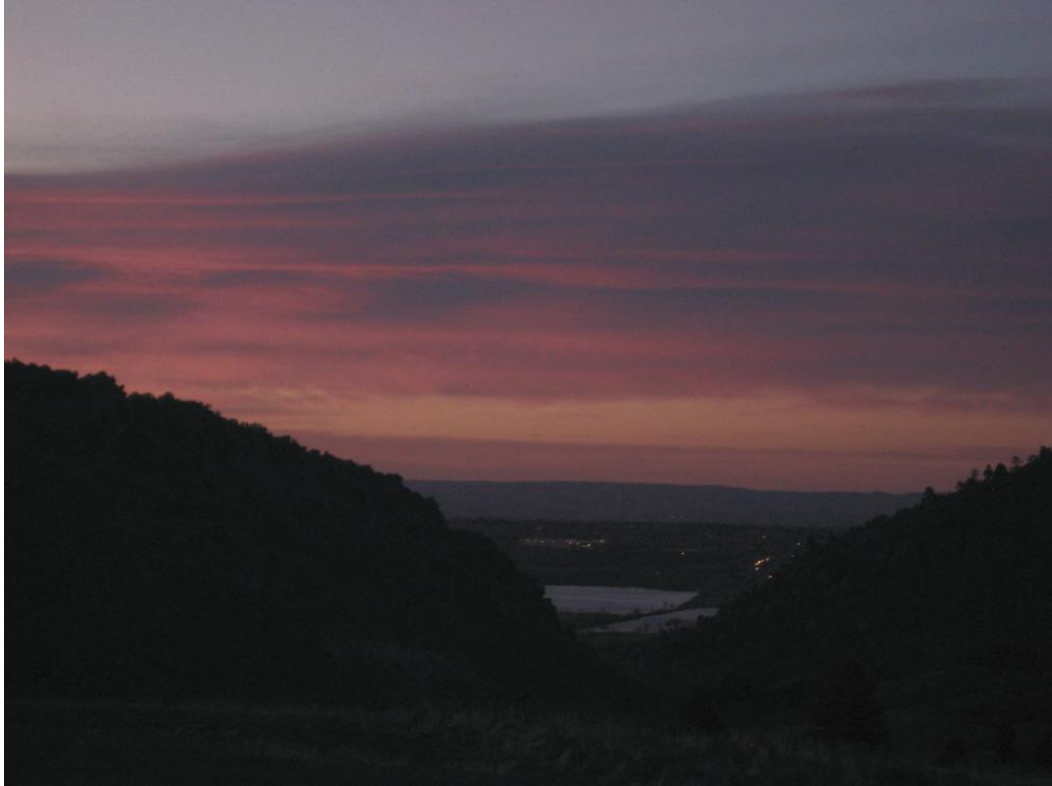
Figure 3: Original Picture

The image reveals a nice contrast between the mountains and the different colors of the clouds in the sunset. Something that I dislike in the picture is that it looks slightly pixelated and a little blurry. I think this is because of the type of camera I was using and if I had my camera it would have turned out a little better. The physics are shown well, but they might have been shown a little better if I didn't mess with the colors as much. Overall, I like the picture, but in the future I would want to take more pictures with a better quality camera and not edit the colors quite as much as I did this time.