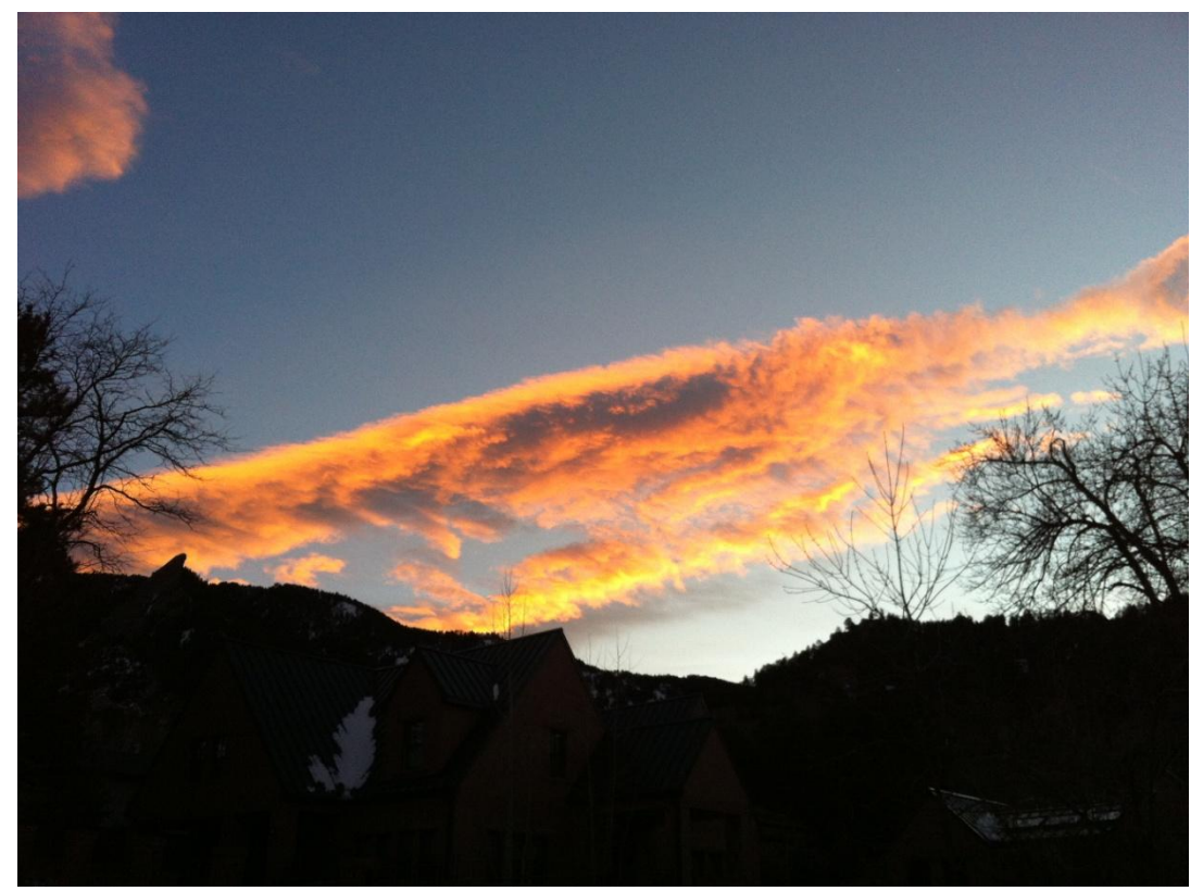
Figure 1: Original Image

The image was captured on the evening of March 3, 2012 around 6:00pm off of 8<sup>th</sup> street in south Boulder, near Chautauqua Park. I had just picked up a friend and was about to head out when we both noticed the sky. The light was fading fast and I needed to capture the scene the best way I could, so I used my phone's built-in camera to get the shot. The direction of the image is looking up towards the first flatiron, which from my position would be directly south-west with an elevation angle of about 60 degrees.