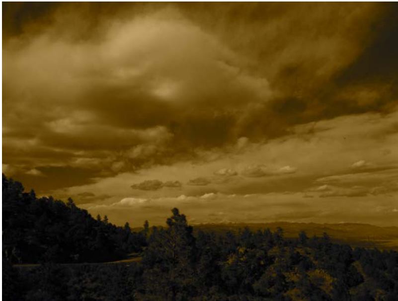
Figure 2: Photo shopped Cloud Image