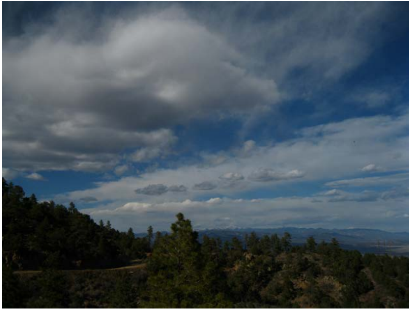
Figure 1: Cloud Image near Shelf Road

The image shown was taken after a day of rock climbing on the car drive back down the mountain. The view from near the peak allows a wide range of clouds to be captured. The clouds pictured include cumulus and altostratus clouds in various stages of development.