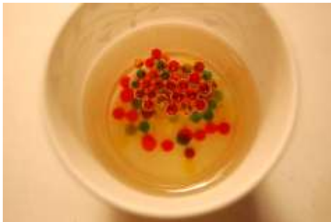
Figure 3 left shows the “Pre-Photoshop” image. The bubbles are small, but clear. The field of the view is about 7 cm. The distance from object to lens was about 10 cm. The image was captured with a Nikon D40 DSLR Camera. The camera settings were ISO 1300, F 5.6, and 1/50 shutter speed (3008 x 2000 pixels).