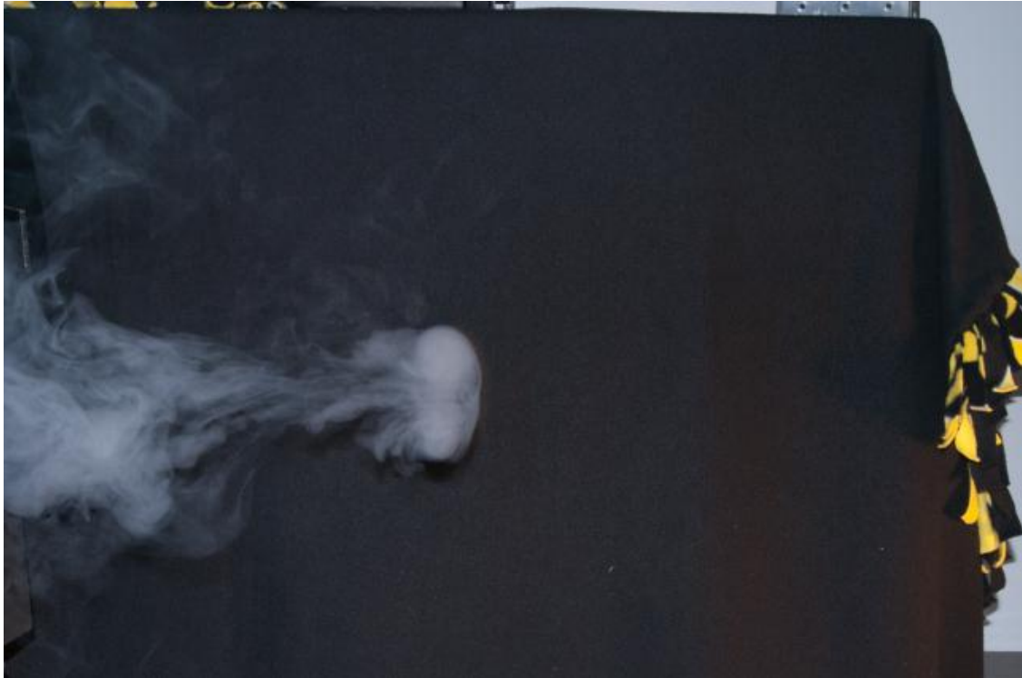
Figure 2: Original Picture

corner over more to the right to darken the background. I also used one of the brush features that was set on a very large size and was on the feather feature to almost paint the background black. I also increased the contrast and noise reduction significantly. In addition to changing the background I also cropped the picture pretty significantly and rotated it 90 degrees. I did this rotation because I thought it looked like a jelly fish and that gave it a better illusion. The edited and original pictures are included in Figures 2 and 3.