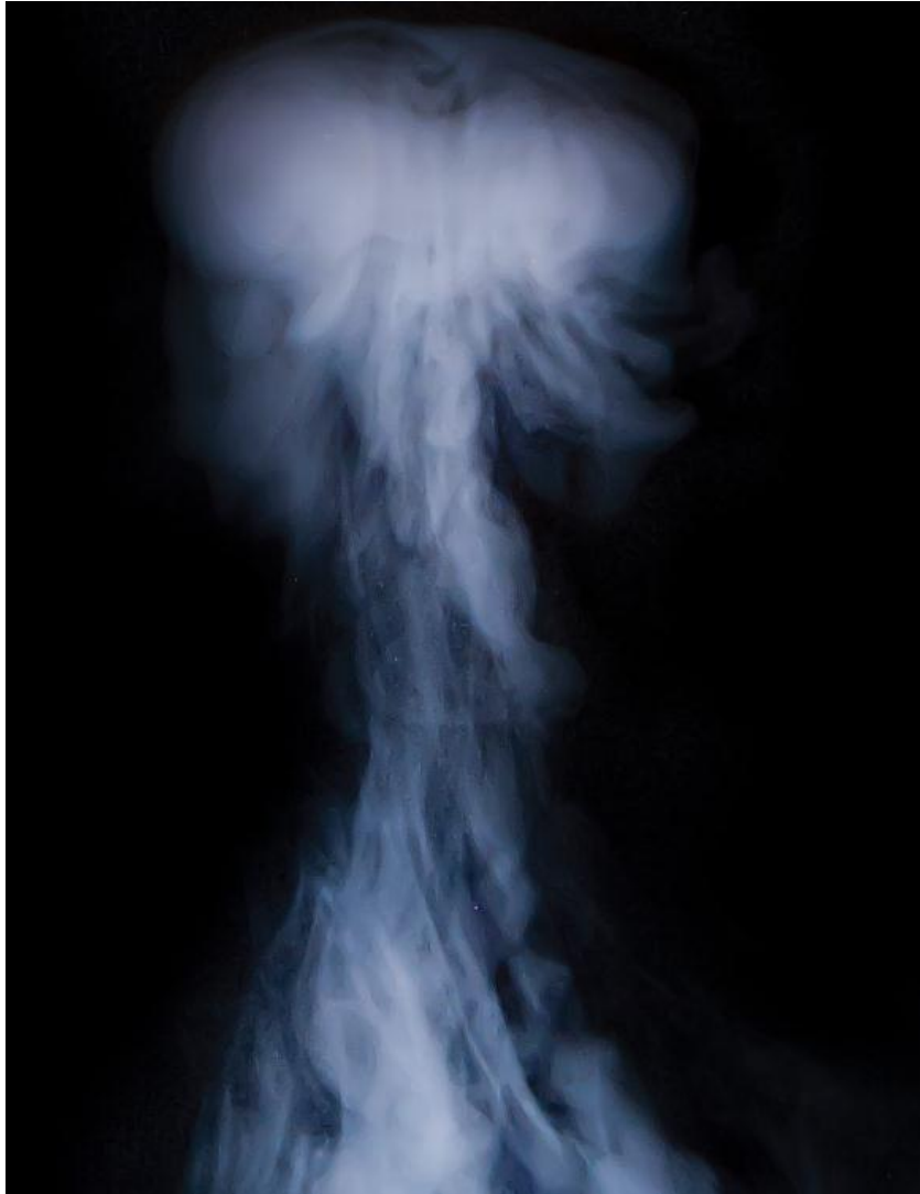
Figure 3: Final Picture