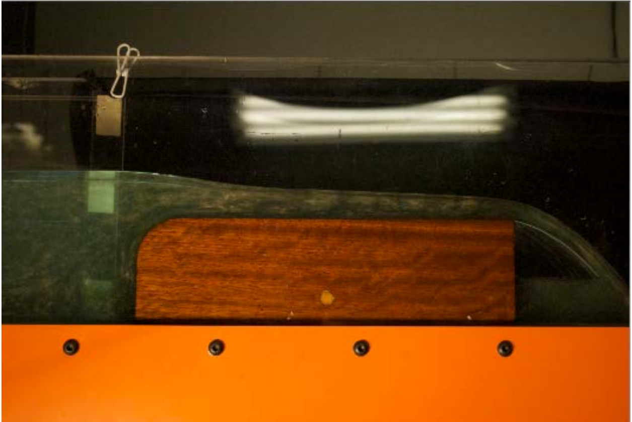
Figure A 1: Unedited Image (3872 × 2592) Pixels