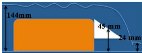
Figure 2: Flow Diagram

Typically weirs are used to disrupt the water movement by introducing a shape that will slow down and deform the natural flow of water. When systems are viewed on large scales many inconsistent values affect the flow rate and head before and after the weir [1]. To account for this variability a dimensionless number was created that can be measured on small-scale experiments and applied to real life scenarios. This value is called the discharge coefficient.