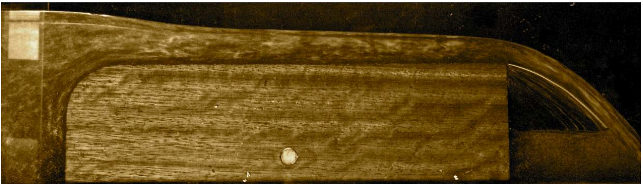
Figure A 2: Edited Image (3366 × 967) Pixels