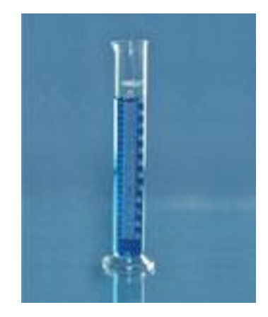
Figure 2.0-1 Measuring Cylinder Similar to the one used in Experiment

For this experiment a glass measuring cylinder roughly 8" tall with a 1" diameter, similar to the one shown in figure 2.0-1, was filled with about 1" of water to start. One end of a 2' long 0.25" diameter plastic tube was placed into the cylinder, but not touching the water, and the other end was dipped into a concentrated water-liquid dishwashing soap solution with a mixture ratio of 1:1. A black felt material was placed on a desk to create a dark surface that the bubbles could be blown onto once the experiment started and a spotlight was placed above the black surface for lighting along with the florescent lights that already existed in the room. Liquid nitrogen was then poured into the measuring cylinder and a towel was placed over the top of the cylinder in order to force the evaporating nitrogen gas and water vapor through the plastic tube, thereby, creating bubbles through the end that was dipped in the soap mixture. A camera was held roughly 5 inches away from the bubbles at roughly a 20° elevation angle in order to get the best lighting. Figure 2.0-2 shows a diagram of the experimental setup.