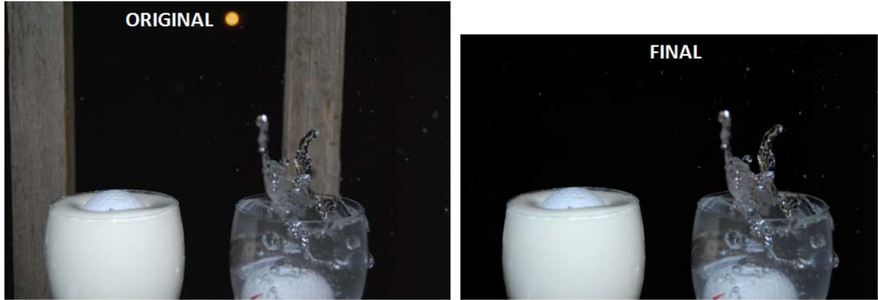
Figure 2: Before & After Post Processing