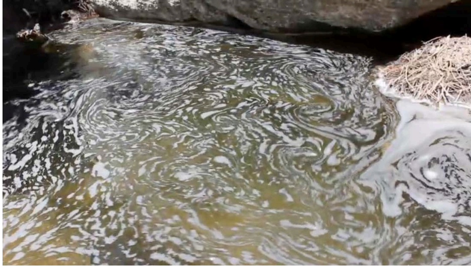
Figure 2: RAW video screen shot

Post processing was done using Windows Movie Maker and adjustments were performed to enhance subtle qualities and produce the final video. Once the video was imported into Movie Maker, the video was turned to gray scale increasing the contrast between the visible flow and the yellowish color of the water. The entire film was then darkened using a darkening algorithm imbedded in the software. This removed some glare and also increased the contrast in the flow. Next, title and credit transitions were applied to the beginning and the end of the video. The video was then played back at “half speed” (according to Windows Movie Maker); this created a calmer, soothing feeling for the video. The author chose to add music for an added effect, obtaining permission by the musician to use for this video. The song was written and performed by Adam Richardson, a close friend of the author, and is titled “Do You Dream”. (More of Adam’s music can be found at: adamrichardsonmusic.com )