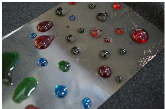
Figure 2: Team 2 Image Showing the Superhydrophobic Surface – D. Leng