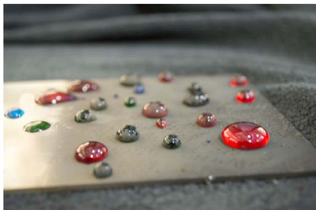
Figure 6: Team 2 Original Image – K. Gresh

Post-processing included: rotation, cropping, saturation, and color adjustments and use of editing tools to remove white border edges (Figure 7). The final image size is 5608 x 2183. The final resolution is 240 pixels per inch.