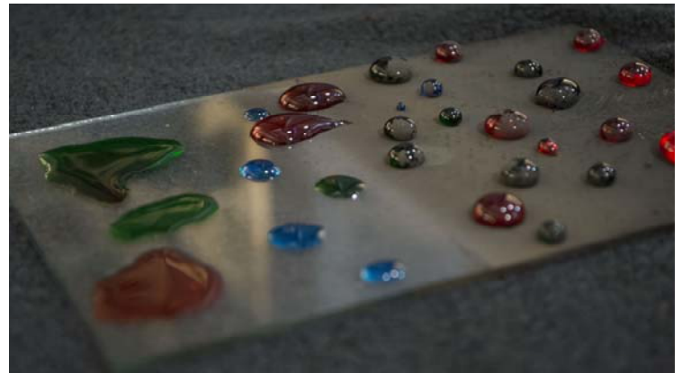
Figure 4: Superhydrophobic Surface and Non-Hydrophobic Surface Boundary

As shown in Figure 4, the Solid-Liquid Interfacial Energy ( \gamma_{SL} ) is consistent throughout the diameter of the majority of the droplets due to being placed on a surface with a single surface energy. A few droplets were placed at the boundary of the hydrophobic surface and non-hydrophobic surface. These droplets exhibit similar contact angles consistent with the surface in which they contact. The treated surface shows a lower solid-liquid interfacial energy and larger solid surface energy as displayed with a greater contact angle.