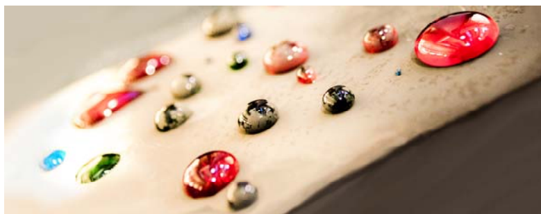
Figure 7: Team 2 Edited Image – K. Gresh

Post-processing included: rotation, cropping, saturation, and color adjustments and use of editing tools to remove white border edges (Figure 7). The final image size is 5608 x 2183. The final resolution is 240 pixels per inch.