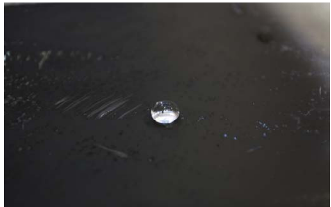
Figure 1: Superhydrophobic Surface (Soot Coated Glass) With a Single Water Droplet - Created by Team 2