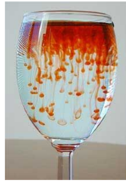
Image 2: Rayleigh-Taylor Instabilities

Rayleigh-Taylor Instabilities occur because of a dynamic process where two fluids seek to reduce their potential energy 6 . It can be seen in the turbulent regime, and since the Reynolds number for this experiment was in the transitional regime, it is concluded that these instabilities are likely depicted in this Image Assignment. These instabilities are characterized by small vortex shedding of the the dye in water.