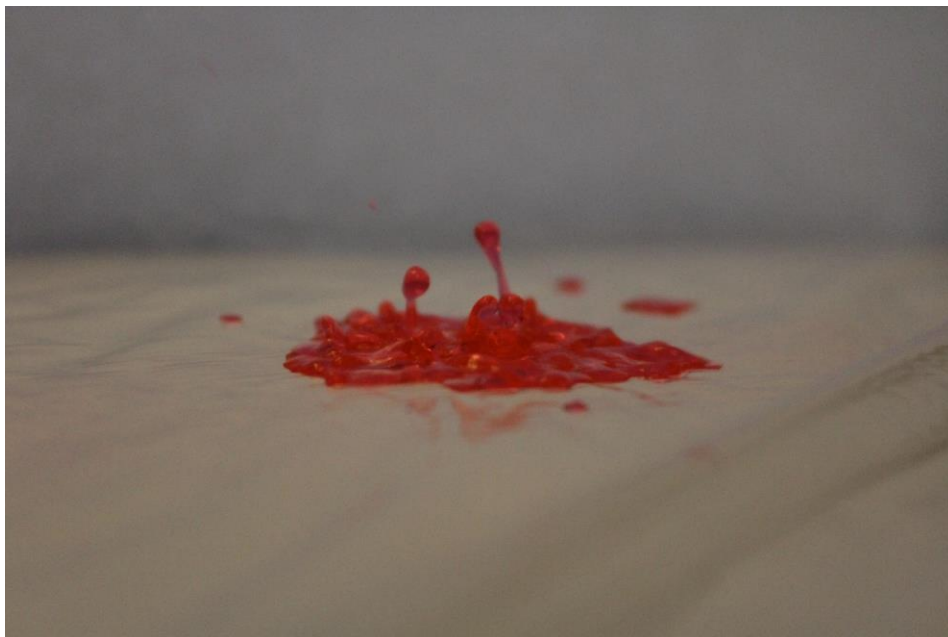
Figure 3: Unedited Image

The image was edited pretty heavily in order to give the feeling of ooze on an alien planet using GIMP. This resulted in the loss of some focus and increasing the effects of some ISO noise already present in the image, however I think the lesser focus and increased graininess of the image helps to add to the effect of making the image appear as though it is on an alien planet with some sort of live ooze erupting from the surface.