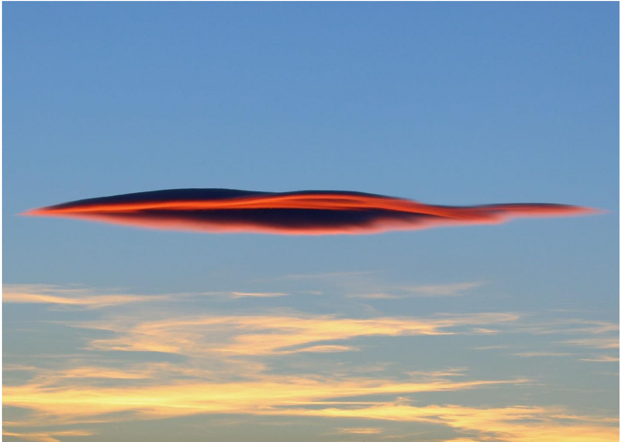
Figure 4: Altocumulus lenticularis 3 minutes after Figure 2

During the time which the cloud was observed it was seen to maintain its position relative to the ground but to vary in shape with time. The spatial extent of the cloud varied and the secondary lenticular was seen to disappear as conditions changed. As the sun continued to set the color of the cloud also progressed into more reddish tones. This progression can be seen in Figure 4 which was taken only 3 minutes later at 8:21PM MT.