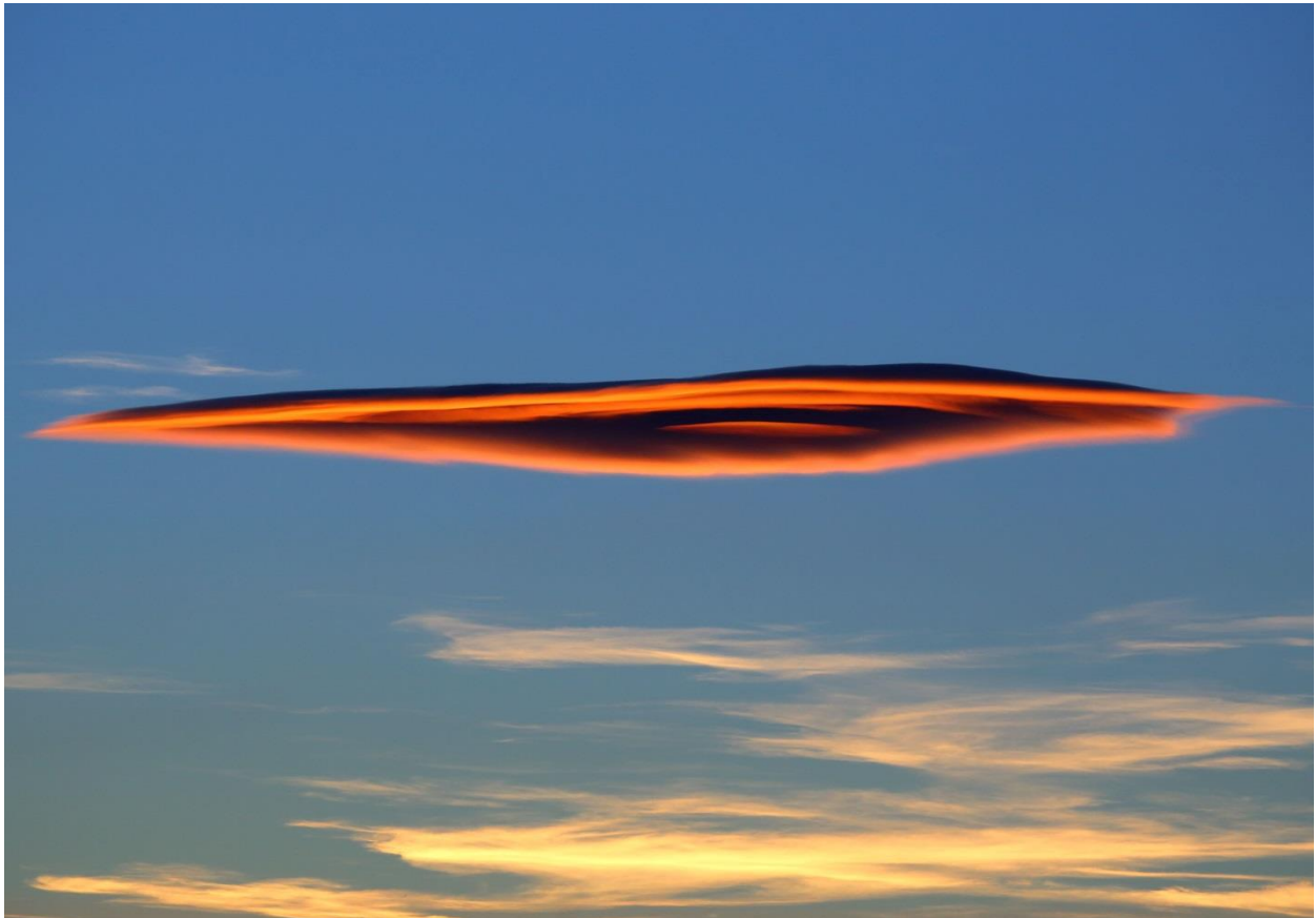
Figure 2: Altocumulus Lenticularis after sunset

The original image was shot in Canon RAW format. The RAW file was first processed in Canon Digital Photo Professional software where the white balance was adjusted to drop the color temperature and recover shades of blue in the sky. The same software was then used to convert the RAW file to a TIF and output the image. The TIF file was then edited in Photoshop Elements 5.0. The image was rotated to align horizontal lines in the image with the bottom of the frame and the resulting image was cropped slightly to square up the rotated image. Finally the contrast was increased slightly. An unedited version of the original photo can be found in Appendix A for reference.