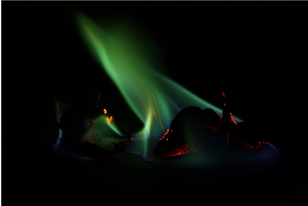
Figure 2: Original untouched image