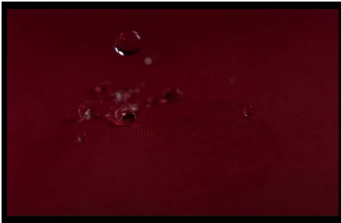
Figure 7: Team 2 Project 2 Video – K. Gresh http://www.flowvis.org/2016/10/22/team-2-project-2-k-gresh/ [Ref 5]