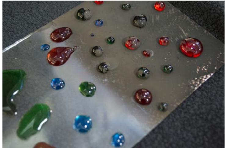
Figure 2: Team 2 Image Showing the Puddle Effect vs Water on a Superhydrophobic Surface