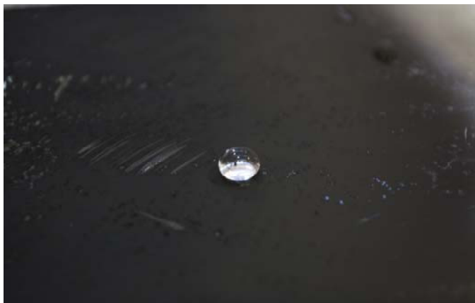
Figure 1: Water Droplet on a Hydrophobic Surface- Created by Team 2

The second team image for the Flow Visualization course at the University of Colorado at Boulder was completed using a high-speed digital camera (Phantom v2011). The goal was to show the fluid interaction between water dropped on to a hydrophobic surface. The water was dropped from a height of approximately 18" on to a hydrophobic surface consisting of a gortex coat. The images created a movie that shows how the fluid interacts on a hydrophobic surface and how dispersion, or the puddle effect typical for water on a surface, is eliminated.