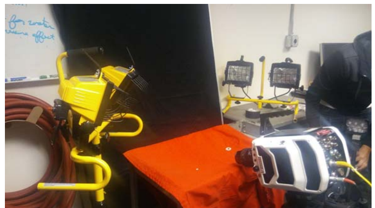
Figure 3: Phantom v2011 Camera Set-Up

The camera was mounted on a tripod and focused on the gortex surface at the point of the water droplet impact (Figure 3).