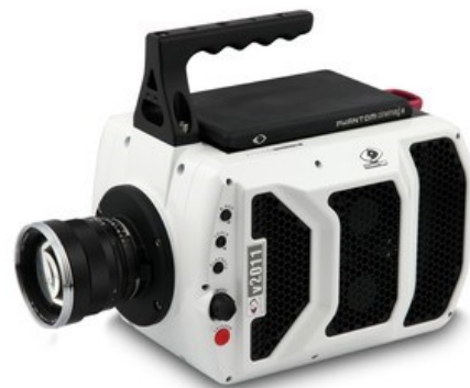
Figure 6: Phantom v2011 [Ref 4]

-Phantom v2011 High-Speed Camera (Figure 6):