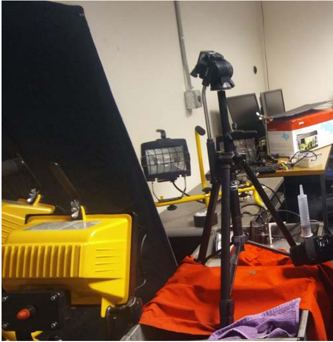
Figure 4: Water Droplet Syringe and Tripod Set-Up

drop the water (Figure 4). Several water droplets were initially dropped to obtain camera focus.