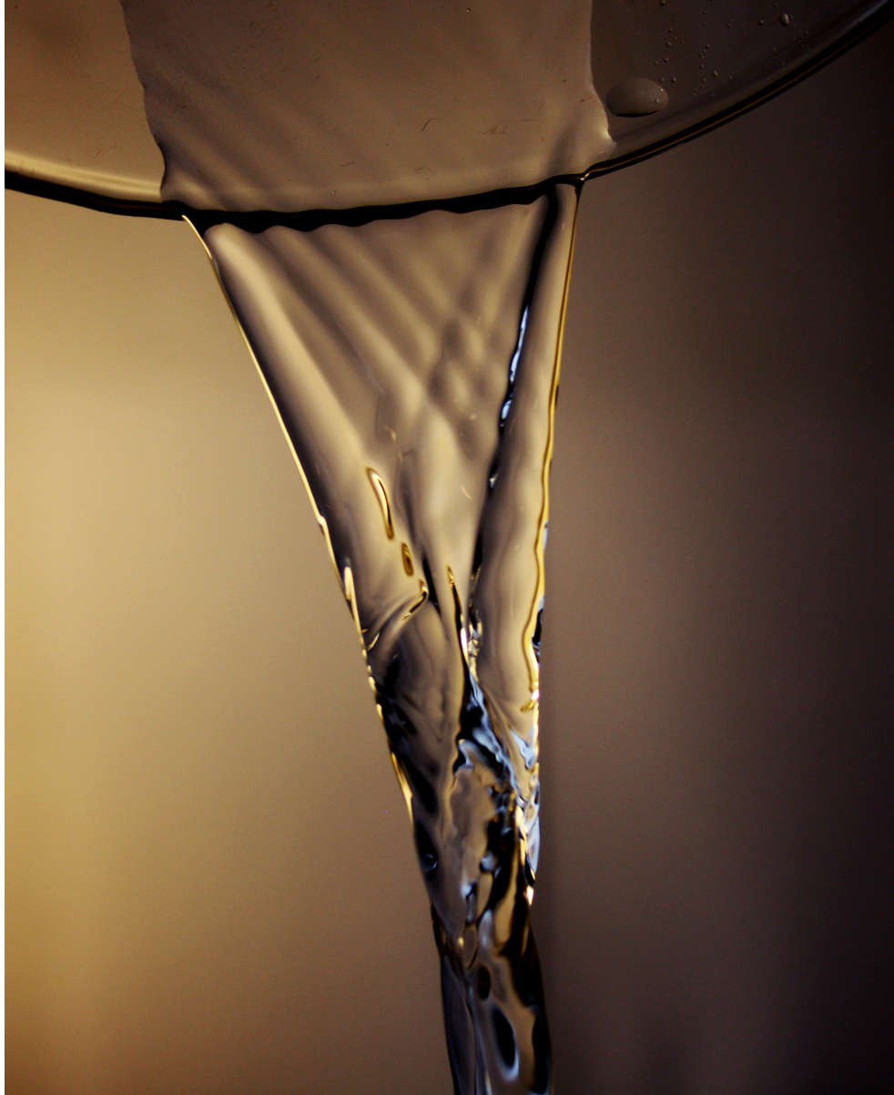
Figure 1: Final Image