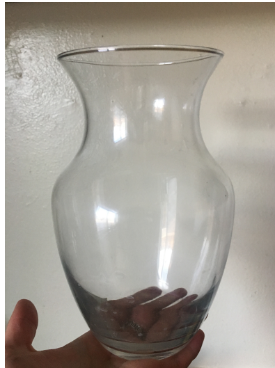
Figure 2: Pitcher used in this experiment.

For this image, the only fluid used was water. The water was poured from a pitcher with a curved edge as a spout, fig. 2, and a top diameter of 4 in. The geometry of the pitcher is what created the waves in the water as it was poured out. The final setup can be seen in fig. 3. Finding a lighting angle that would highlight the waves was difficult and took much experimentation. The lighting for the final image consisted of light from a window and desk lamp below and to the left of the water. Behind the water, white paper was placed on a music stand to reflect the light back through the water and proved a clear background. It was a dreary day, so the light from the window was not sufficient to correctly illuminate the water.