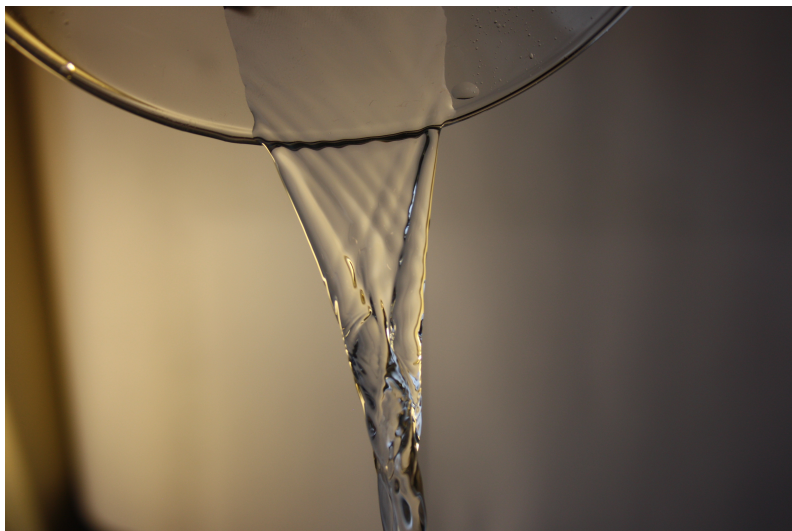
Figure 4: Original image.

The original image can be seen in fig. 4. From here, the image was cropped, and adjusted using Adobe Photoshop. The adjustments done are pictured in fig. 5 for the curves. The color balance for the midtones was moved to +20 blue, with the other colors remaining at 0. No other post processing or editing was done to the image.