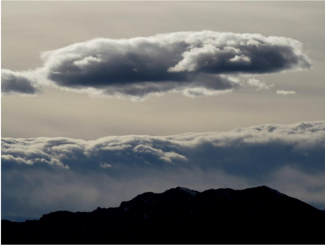
Figure 1: Final Image