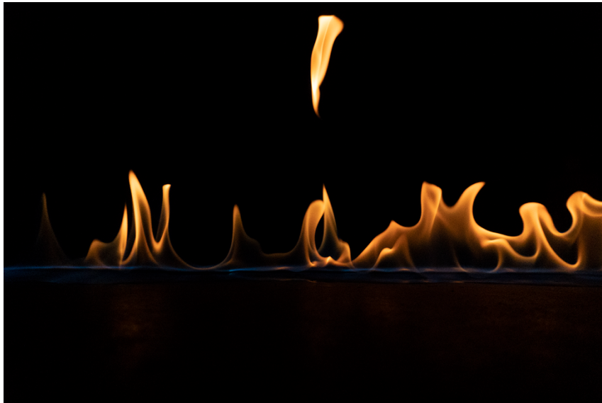
Figure 2: Raw Image of Flame

The flow in Figure 2 is that of isopropyl alcohol burning on a concrete floor. This is the release of the energy stored in the chemical bonds of the isopropyl alcohol to produce a flame. This produces a laminar flame similar to a candle flame with the blue underneath portion. Overall heat production of this flame is low but can be high in some points of the flame. This overall is a laminar flame caused from the burning of the isopropyl alcohol on a concrete surface.