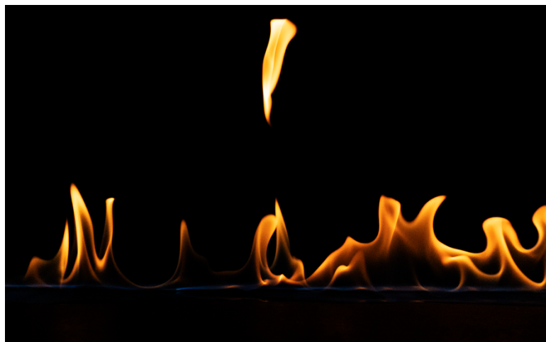
Figure 3: Final Posted Photo

The setup of capturing this fluid flow is pretty simple with the right camera setup. The field of view of this image is 3 feet wide pool of burning isopropyl alcohol. The camera is about 3-4 ft from the flame for both safety and to capture the entire flow phenomenon. The focal length is 16. We used an exposure time of 1/1600 and an ISO of 6400. This Photo was taken on a SONY ILCE-6300. The photo went through post processing to produce Figure 3 was simply cropping it to center the jumping flame into the center of the image using the grid display in photoshop. As well as editing curves to bring out the three dimensionality of the photo.