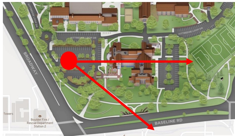
Figure 1: Map of CU campus, showing my orientation when taking the photograph.

This picture was taken in the Flemming parking lot facing Southeast looking above Wolf Law. I was standing at ground level and the camera was aimed at the sky at an angle of about 30°. It was taken at 6:00 P.M. (00Z) on October 16, 2018 figure 1 below shows the location and direction of the camera shot.