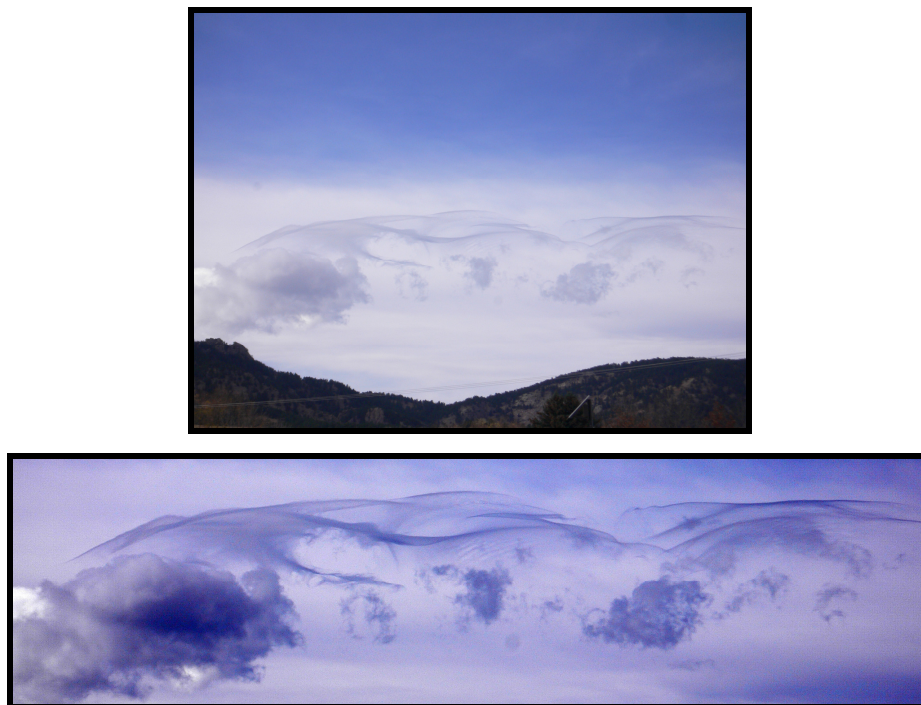
Figure 3: Comparison Between Original and Final Image

The contrast was increased, and the brightness decreased to bring out the details of the front Cirrus clouds in Adobe Photoshop. This proved to give a smoother image, and provided more detail information for the observer. The image was also cropped, to remove distracting details. The original photograph is compared to the adjusted one below (Figure 3), to show this added information.