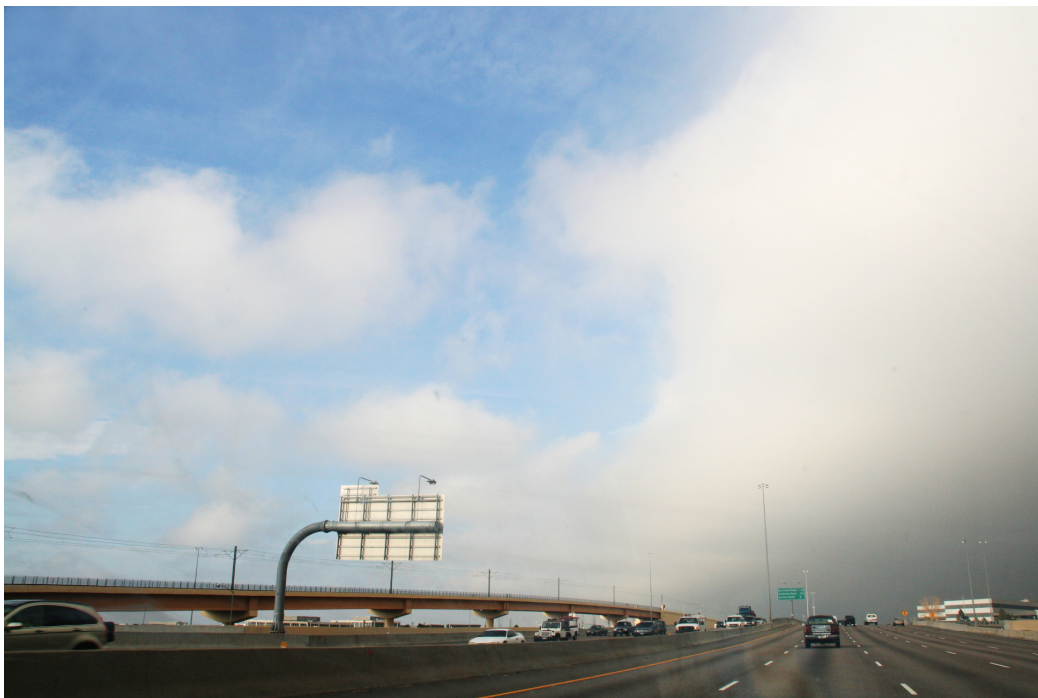
Figure 2 is a Skew-T plot of the sounding data from November 21st downloaded from the website of the University of Wyoming. I captured the picture at 14:25 pm on