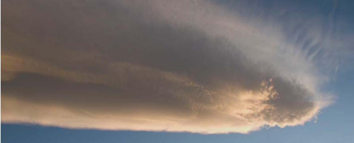
Figure 1 - Final cloud picture

For the second cloud assignment, I decided to focus on a larger, more dramatic cloud than I did in the first assignment. To do so I decided to wait till sunset because at that time clouds form and move over the mountains. The movement of the clouds over the mountains causes a dramatic scene that has several different cloud formations and different colors throughout them. That is the type of cloud I would like to capture.