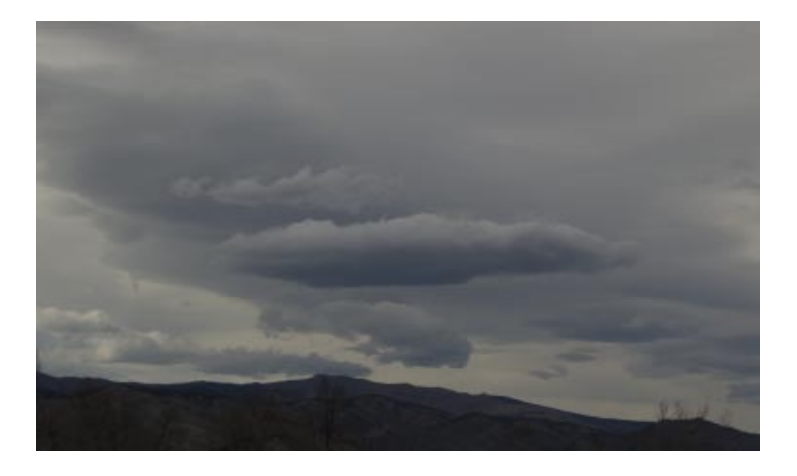
Figure 2: Original image

clouds in the background of the image are very bright. The various levels in the image are very pleasing. The mountains on the bottom of the image have a great amount of detail and are very dark compared to the rest of the image. The image seems to fade from bottom to the top. The main cumulus fractus cloud in the center of the image seems grainy and that would be one area where the image could be improved. Another cumulus fractus cloud was apparent in the sky when this image was taken. Mountain wave seemed to separate these two cumulus clouds and it would have been cool to see both cloud formations in the image.