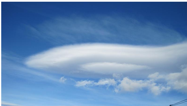
Figure 3: Original Image

This photograph was taken with a Canon PowerShot SD1200 IS digital camera. A smaller, lighter camera was used since it needed to be carried at all times for immediate response to instant cloud formation. The size of the field of view is difficult to gauge in cloud applications, but the largest altocumulus cloud is estimated to be on the order of one to two kilometers long. The smaller cumulus clouds are estimated to only be 1,500 ft away, the altocumulus clouds are estimated to be about 10,000 ft away, and the cirrus clouds are assumed to be at least 17,000 ft away. To resolve each of these clouds the focus was set at infinity with a minimum aperture value of F2.8. Since a large field of view was required, the minimum focal length of 35 mm was set for a wide shot. ISO value was set at 80 since ample light was available. The shutter speed was set at 1/100 th of a second since the clouds were nearly stationary. The original and final image pixel dimensions were 3648 by 2048 and was unaffected by editing. Photoshop 5.5 software was used to enhance the image. Power lines in the lower right corner were removed using the clone stamp tool. The contrast was also increased to deepen the blues of the sky and lighten the cloud to make it more eye catching. The original image is shown in figure 3.