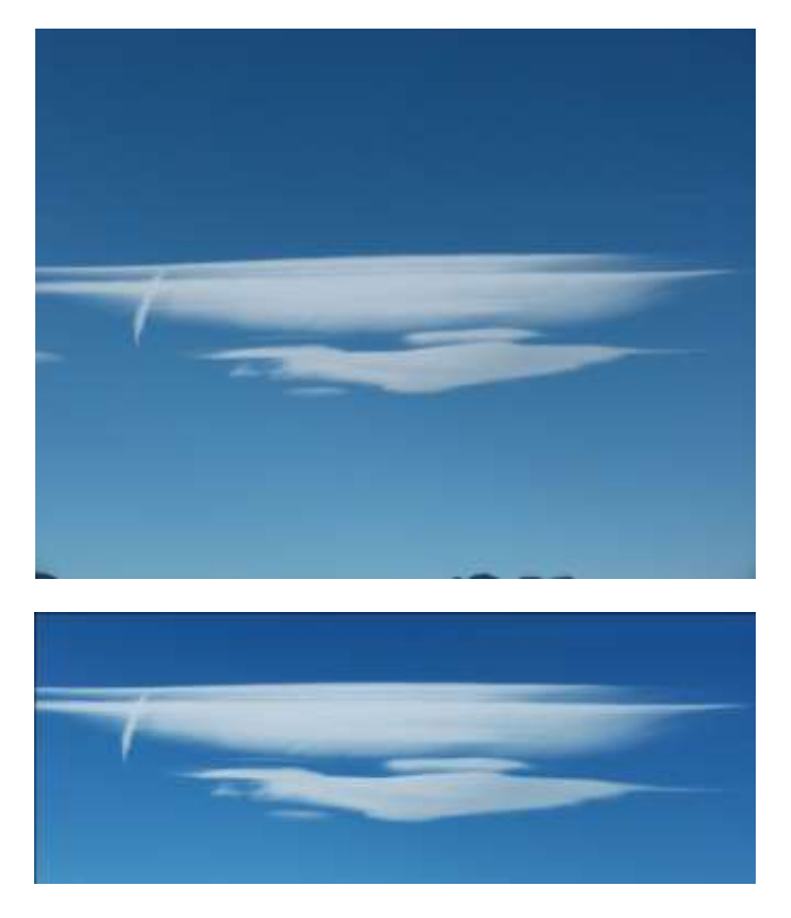
Figure 4. Cloud image before (top) and after (bottom) post processing.

Adobe Photoshop CS5 was used for post processing of the cloud image. The original 4320 x 3240 pixel JPEG image was imported into Photoshop to begin post processing. The image was then cropped to 5174 x 1935 pixels in order to remove any unwanted sky and mountaintops and to make the cloud symmetric with the sky from top to bottom. The 'With Perspective' option was used when cropping in order to straighten the slightly skewed angle of the flat cloud tops that were present in the original image. The contrast was then adjusted from zero to 50 in order to highlight the cloud edges and the feather cloud. A few small clouds visible on the edges of the photo were removed using the Spot Healing tool in order to focus more on the subject of the large altocumulus cloud. The original image and post processed image are shown top to bottom in the figure below.