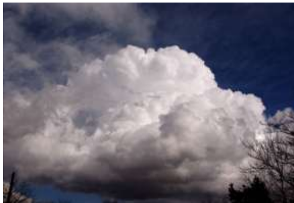
Figure 1: Cumulus congestus

Originally this cloud was spotted while I was on the CU campus after coming out of class. It looked like a very interesting cloud so I went home to get my camera and found a good vantage point. This picture was taken at 14:07 on a sunny day in Boulder on March 4 th , 2011. The cloud was forming due east of Boulder, and the lighting was very good. The image was taken from west of campus looking east at an angle of about 20 degrees above the horizon.