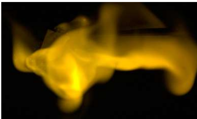
Figure 2: The trail of flame to the right of the paper gave the paper thrust ejecting it from the mounting bar

In the video it can be seen during the second combustion the flash paper and the mounting wire are ejected from the flash paper stand and the flash paper goes tumbling down out of the field of view. The flash paper in this trial was folded twice into a rectangle of approximately 1.5in x 1in. As the paper ignited, the folds in the paper formed a pocket which acted as a nozzle for the flame (Figure 2). This caused the flame to exit the fold horizontally and acted as thrust, pushing the flash paper off of its mounting on the metal bar.