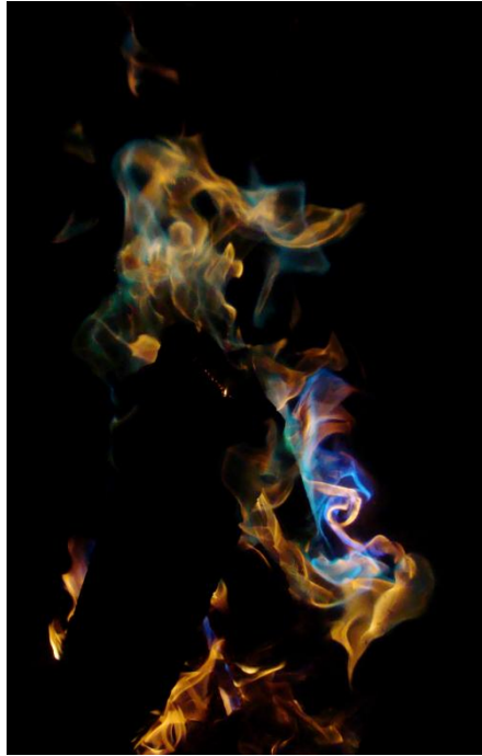
Figure 4: Final edited image

the clone stamp to touch up some minor ghosting effects found at the edges of the flames. The final edited image is shown in Figure 3.