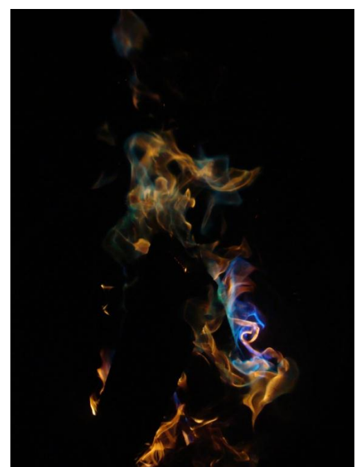
Figure 3: Original unedited image

My main goal for this photo was to get an in-focus and accurate image of a fire with a good amount of color to help show the phenomenon being captured. This image was shot using a point-and shoot Sony DSC-H10 8.1MP camera. By knowing the size of the fire and camera distance the field of view is calculated to be 76°. The shutter speed was set to 1/125 of a second at an ISO of 800; this seemed to provide the best combination to help bring out the detail of the fire. The camera was at a focal length of 6.3mm and an aperture stop of 3.5. The original image was 2448x3264 pixels and is shown in Figure 2.