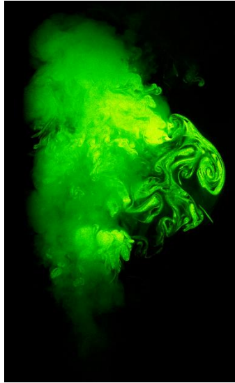
Figure 1: Final image submitted for the second team project.

For the second team project assignment a goal was set out to photograph a turbulent jet. The inspiration for this image came out of the turbulent flows chapter in van Dyke's An Album of Fluid Motion [1]. The intent in creating this image would be to visualize the different scales of turbulent structures. By using a high powered laser a sheet of light was used to illuminate a jet of stage fog resulting in the final image as seen in figure 1. Different turbulent scales can be seen here in the many eddies that were located in the plane of the laser sheet.