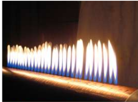
Figure 4: Shutter speed 1/30 s, f/ 4.5, focal length 18.8 mm