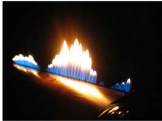
Figure 5: Shutter speed 1/20 s, f/ 4.9, focal length 23.1 mm