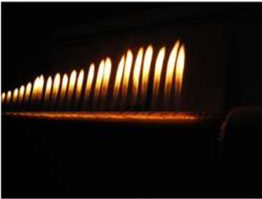
Figure 3: Shutter speed 1/160 s, f/ 7.1, focal length 9.0 mm