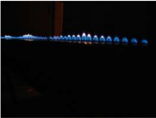
Figure 2: Shutter speed 1/20 s, f/ 2.8, focal length 7.7 mm

The still photos shown throughout the video were taken with a Canon Rebel XSi EOS 12.2 megapixel digital camera. They are each 3072 by 2304 pixels. The depth of field for these photos was between ten inches and 1.5 feet. Because many of the shots show a view down the length of the tube, only some of the flames are in focus. The focal length, f-stop, and shutter speed values of some of the photos are shown in Figures 2-5 below. The video clips were filmed with an HD Flip Camera. The frame dimensions are 1280 by 720. The videos had a greater depth of field of several feet, enough to keep the entire Rubens Tube in focus when viewed from the end. All the photography was done on 4/12/11.