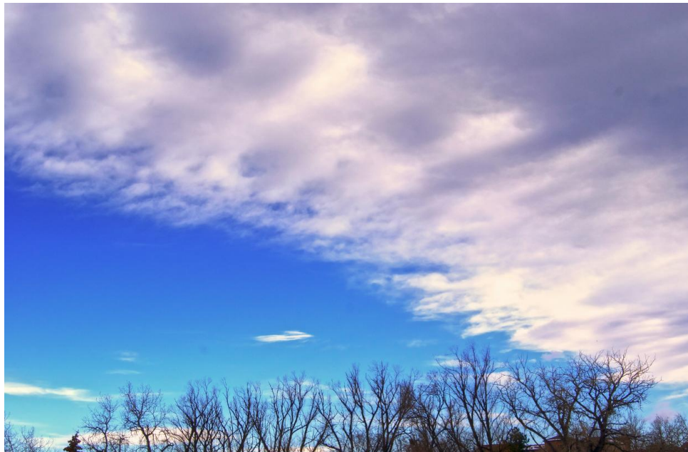
Figure 2: Final Picture

In this picture, I really wanted to show as much of the sky to really capture the edge of the cloud. I wasn't sure how to do a panoramic view, so I just zoomed out as much as I could to capture the cloud. I estimate that the field of view in the picture is 6,000 feet. The camera I used was a Sony DSLR-A230. The shutter speed was set to 1/250 sec and the F-stop was f/13, the ISO was 100, and the focal length was 30mm, and the final pixel dimensions are 3,732 by 2,448. I did end up editing this picture from the RAW image produced by the camera. I basically messed with the curves a little, added some saturation, and the contrast of the picture as well as cropping the edges slightly. I have also included the before and after pictures.