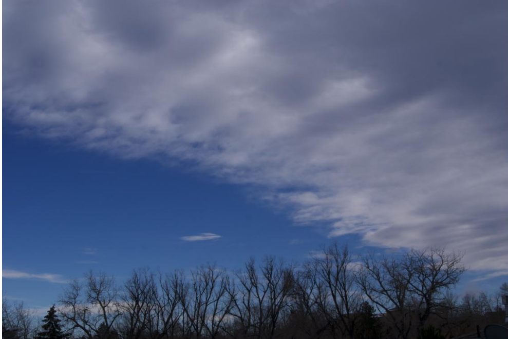
Figure 3: Original Picture

I think this image reveals what I wanted it to. I like how I kept the trees in the picture to create a nice contrast with the clouds. I like the appearance of the trees almost reaching out for the clouds and the clouds almost appearing to reach back towards the trees. I also really like the final color scheme for the picture. One thing that I don't really like about this picture is the view. I think the picture would have been more interesting if I had taken it from a different direction or if I was higher. One thing I would also consider if I was re-doing this picture again would be to consider including the trees in the border of the picture. I could never make up my mind if they were distracting or interesting to have in the picture. Overall, I am pleased with the picture I took and I think it clearly exemplifies the physics occurring in the clouds.