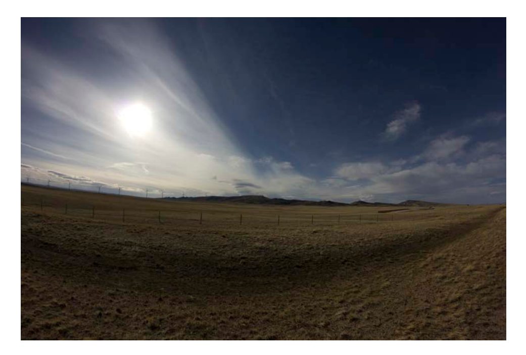
Figure 3: RAW image. Size 5184x3456 pixels

Post processing was then done using Adobe Photoshop CS5 and adjustments were made to enhance certain qualities and produce the final image. To achieve the red and black effect, the temperature was increased from 5,850 to 50,000 and the tint was increased to +150, this creates the red hue throughout the image. Next, the blacks were increased to +90, this deepened the blacks and also increased the contrast. Finially the image was cropped to 5180x2351 pixels giving the "wide screen" feel. The final image is seen in Figure 4 below.