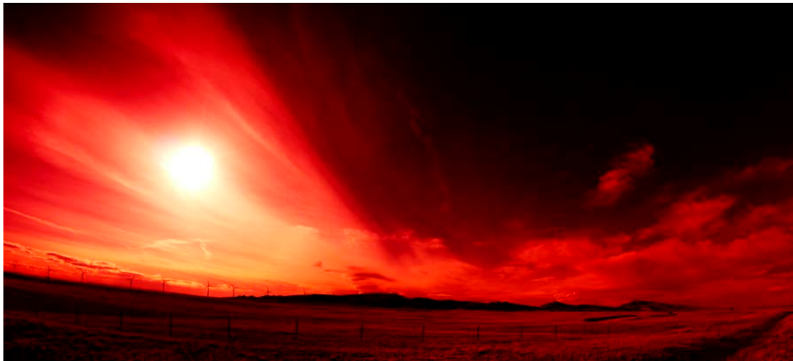
Figure 5: Final Image. Size: 5180x2351

Post processing was then done using Adobe Photoshop CS5 and adjustments were made to enhance certain qualities and produce the final image. To achieve the red and black effect, the temperature was increased from 5,850 to 50,000 and the tint was increased to +150, this creates the red hue throughout the image. Next, the blacks were increased to +90, this deepened the blacks and also increased the contrast. Finially the image was cropped to 5180x2351 pixels giving the "wide screen" feel. The final image is seen in Figure 4 below.