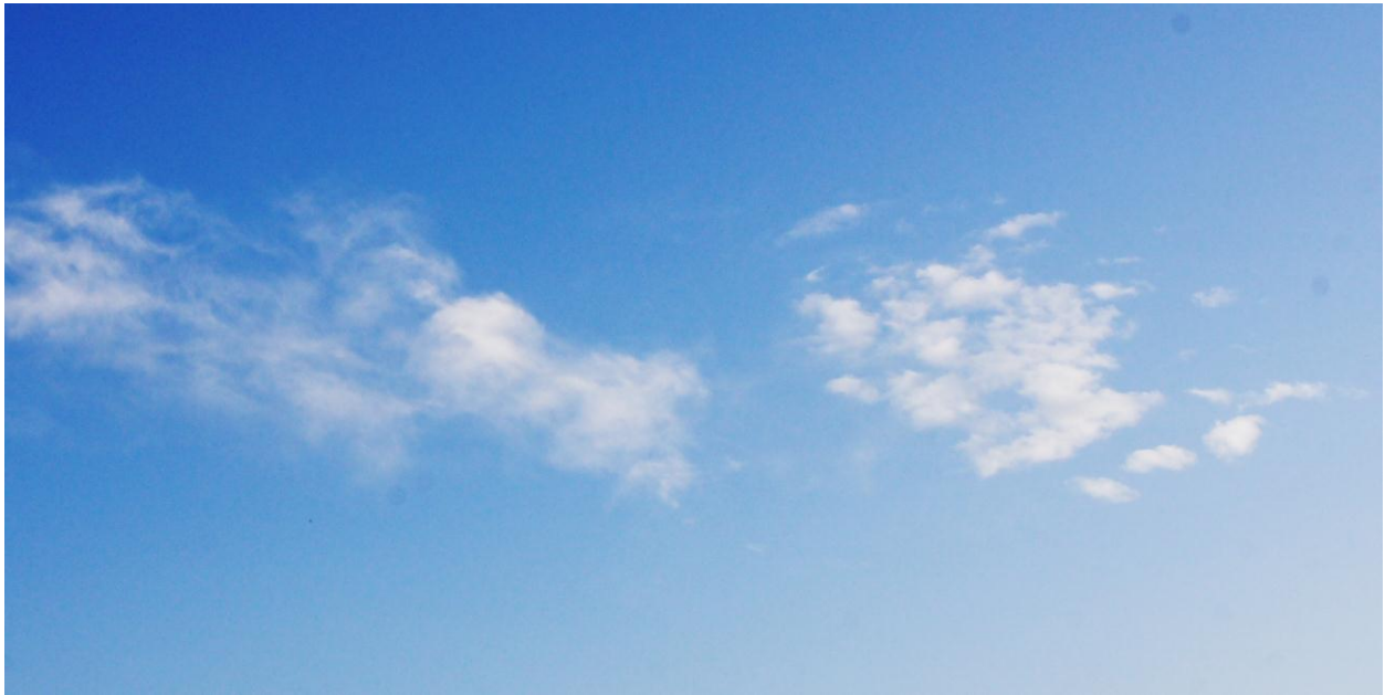
Figure 1 - Submitted Image

The image seen below is a submission for the spring semester of Flow Visualization assignment, “Clouds 2”. This assignment prompted students to search for and photographically capture artistic cloud phenomena. Clouds are everyday fluid flow visualizations and are thus relevant to the course.