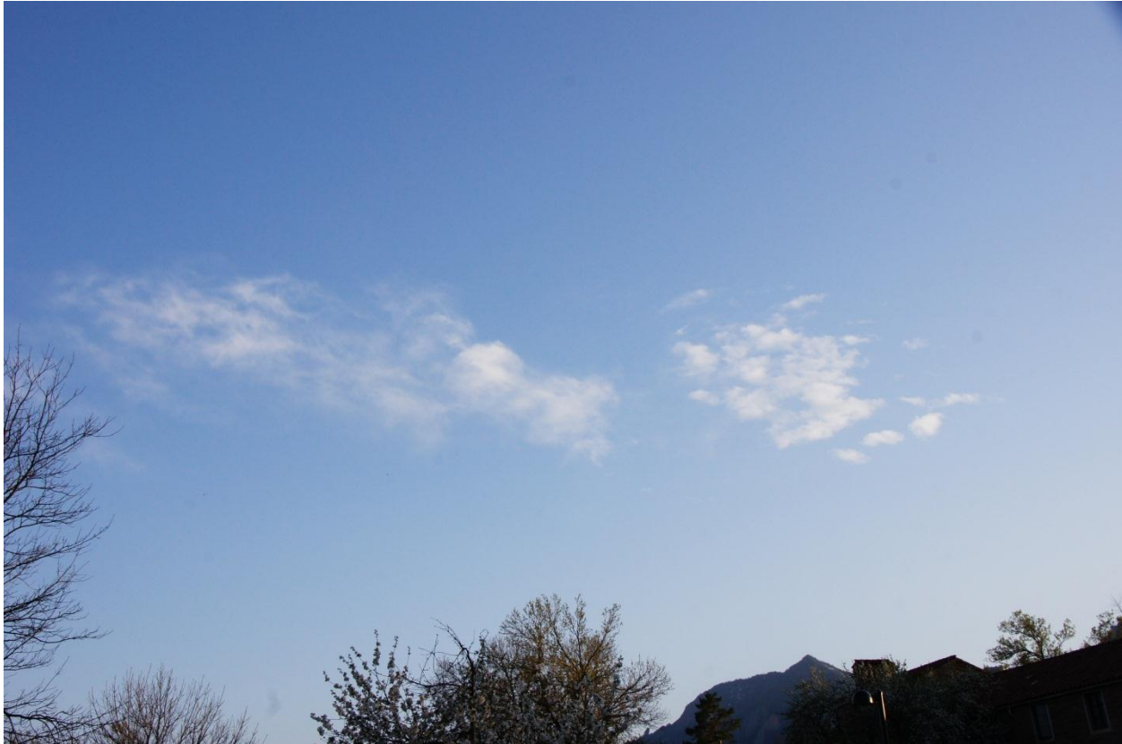
Figure 3 - Original, Unedited Image

The original, unedited image can be seen below. It was taken using a Sony SLT-A55V DSLR camera.