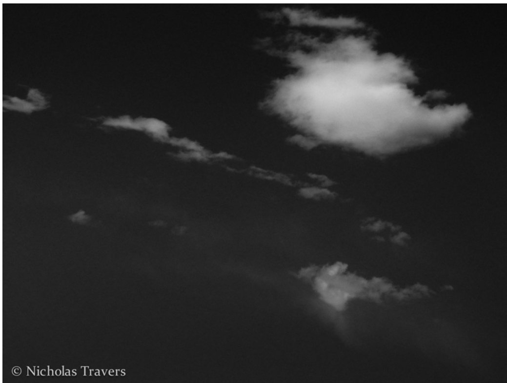
Figure 1 - Cumulus humilis in foreground, and cumulus with faint virga in lower right of frame.

An investigation was undertaken to observe and capture various cloud formations, the intent of which was to learn to identify different cloud types and to develop an understanding for cloud formation processes. A focus of this second investigation of clouds was to photograph and discuss the accessory cloud virga. The imaging technique used is presented and reviewed. The image was produced for the assignment titled clouds2 , of the mechanical engineering course Flow Visualization 1 at the University of Colorado at Boulder. The assignment's intent is to encourage students to observe weather phenomena as embodied in the clouds, and capture them in a visually pleasing manner.