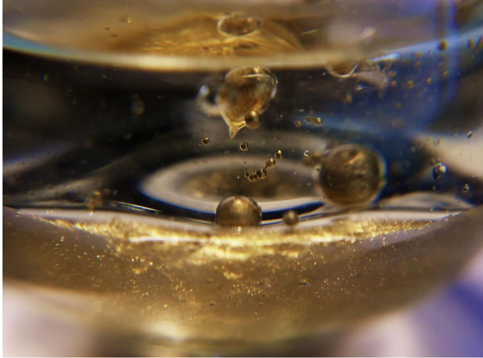
Figure 3: Edited Picture